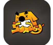
Sumdog Free (iOS) Free (Google)